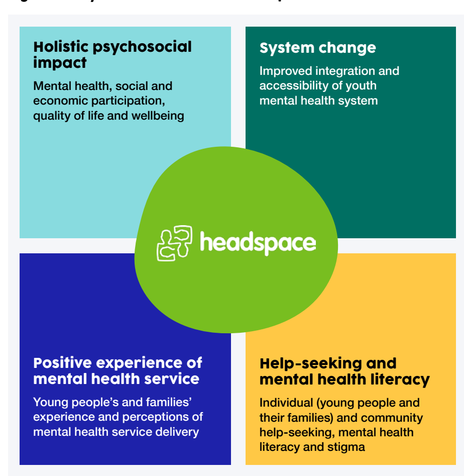
Figure 2: Key outcome areas for headspace centres

four key outcome areas presented in Figure 2 capture the broad range of impacts that headspace centres deliver, alongside the individual-level outcomes of clinical interventions.